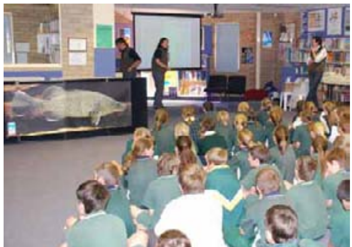
Above: A school workshop held during Native Fish Awareness Week 2008.