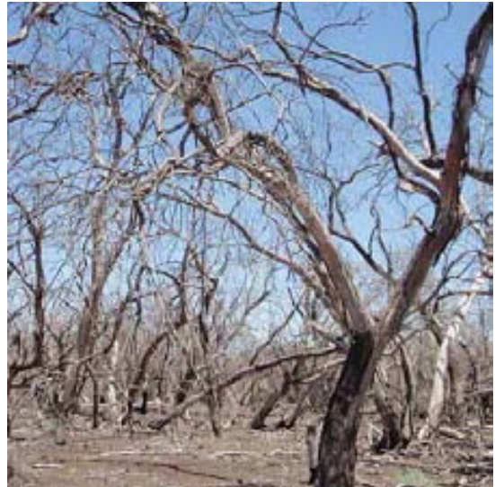
Above: The dying redgums.

http://www.dwe.nsw.gov.au/water/monitor_snowy.shtml