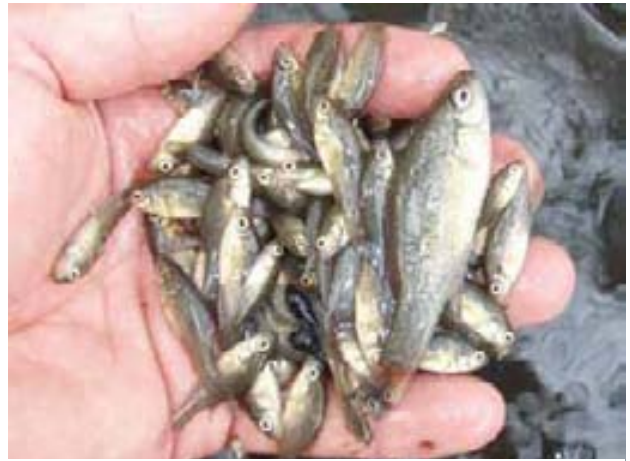
Above: Some of the southern pygmy perch found in the drying pools.

Below left: Rescuing the perch from a pool in Coppabella Creek in February. Below right: The same pool dried out a month later.