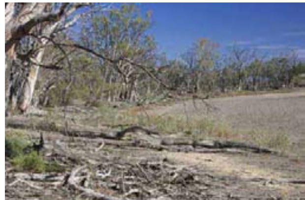
Chowilla floodplain, SA.

http://www.environment.gov.au/water/environmental/cw/wh/watering/samurray.html#rocky-gully