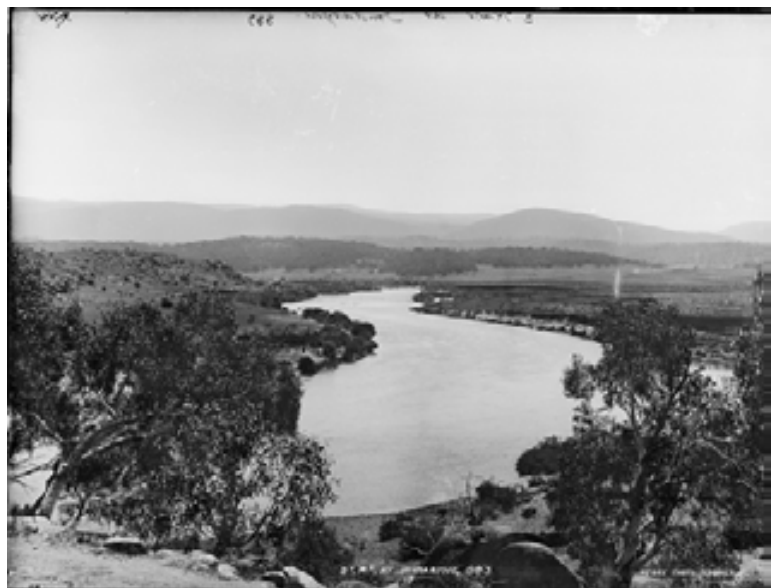
Above: The Snowy River at Jindabyne, 19th century.