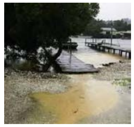
Clyde River in 2006.