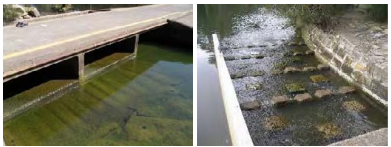
Above: The original culverts at low tide, and the new fishway near high tide.