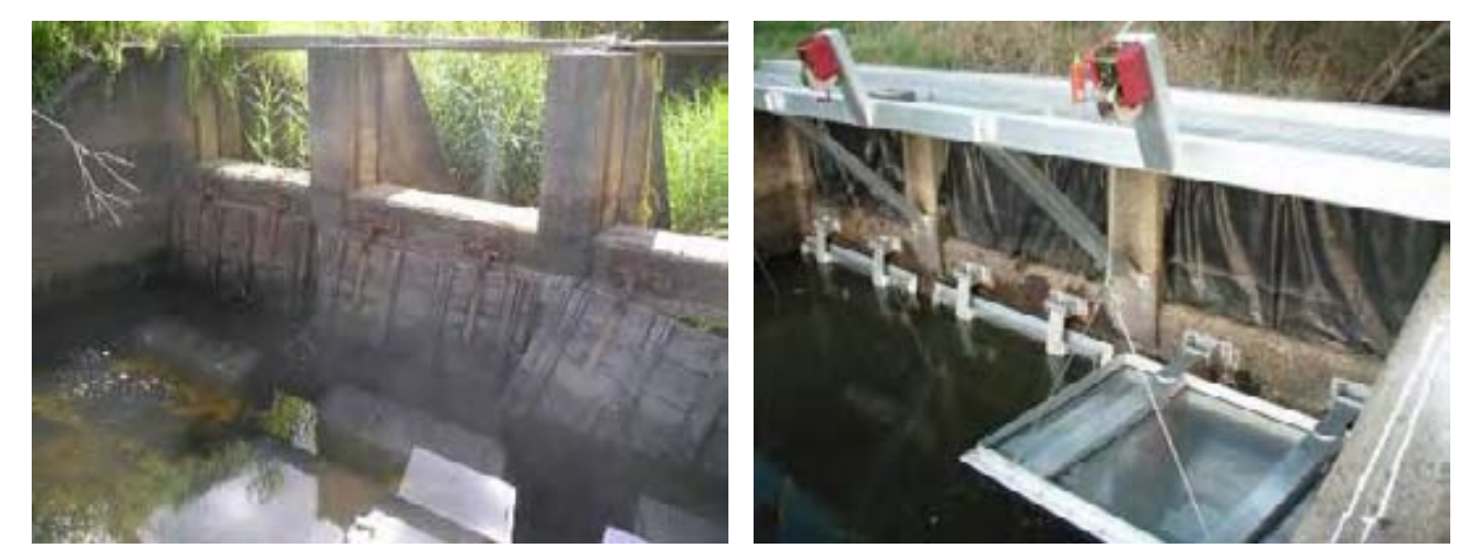
Above: The old wooden floodgates, and the new gates with winches and platform.