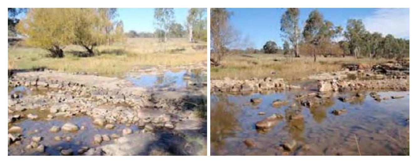
Little River causeway before and after remediation.

Remediation of a causeway on the Little River in NSW Central West has opened up 63km of water for native fish. Little River is one of the most pristine waterways in the Central West catchment. It has large areas of excellent riparian vegetation and deep refuge pools that are home to a healthy array of native fish species ranging from small gudgeons to the larger freshwater species, the Murray cod and golden perch. The river is also a haven for at least five endangered freshwater species. The 400 mm high causeway was built in 1951 on natural bedrock in a shallow section of the river. The Department of Lands Soil Conservation Service removed part of the causeway and adjusted large protruding rocks to prevent damage to vehicles fording the river. Parts of the causeway were kept intact to bypass a natural boggy spring, to help stabilise the bank, and reduce the impact of vehicles on the river bank. The project is a collaboration between Central West CMA and NSW DPI. For more information contact Kirby Byrne.