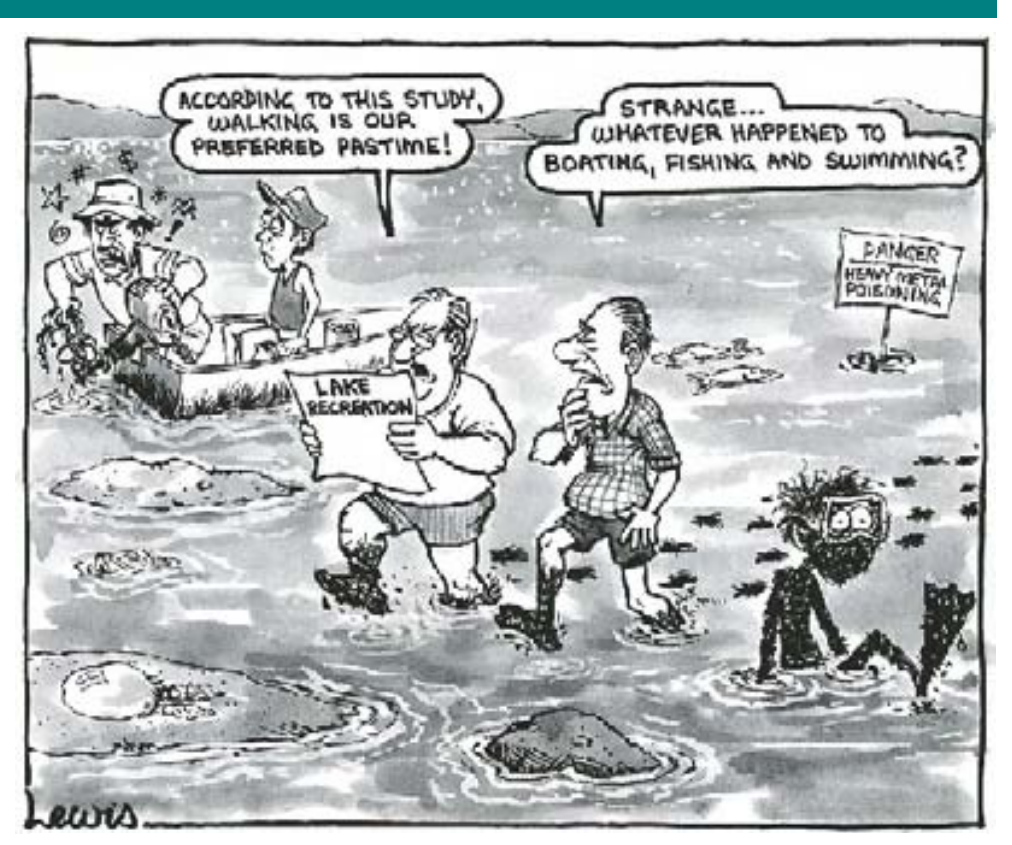
Above: How Herald cartoonist Peter Lewis saw the Lake Macquarie in 1997. Source:

WATER clarity in Lake Macquarie has improved by 96 per cent in the past 10 years. Since 1999 the Lake Macquarie Improvement Project has spent $27 million reducing sediment and nutrient inflows. Hundreds of volunteers have rehabilitated wetlands and planted 600,000 plants. Seagrass cover, the foundation of the lake's ecosystem, has increased by 25 per cent or 2.5 million square metres over that period.