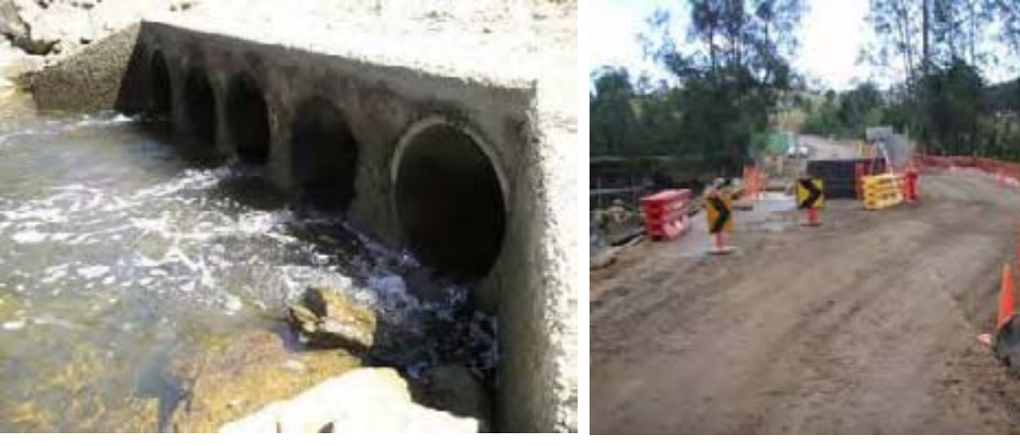
Above: The problematic causeway pipes at low tide.