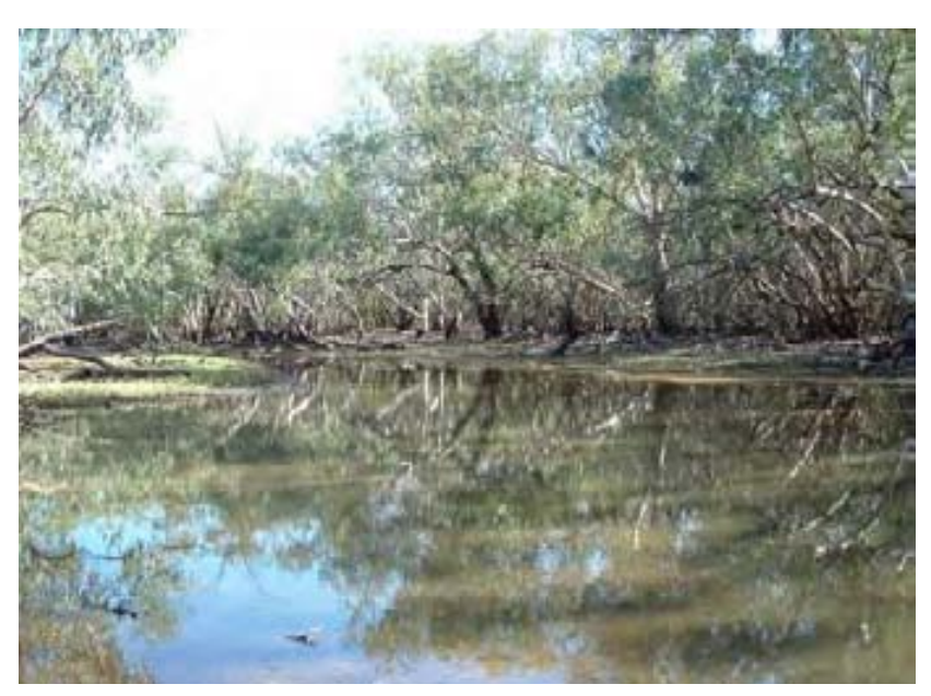
Above: A healthy, well-managed wetlands on Boree Plains.

Several landholders in the Central West catchment now have wetland management plans thanks to Central West CMA funding and NSW DPI expertise. Nine plans are completed and the CWCMA has funded a further three landholder plans including one being developed for the Warren Aboriginal Land Council. A further two plans are being produced in the Macquarie Marshes for the Department of Environment and Climate Change under the Rivers Environmental Restoration Program. DPI wetland officers work with each landholder and agency to identify goals and actions needed to manage the wetlands, and assist with funding applications. Well managed wetlands such as this one on Boree Plains provide healthy