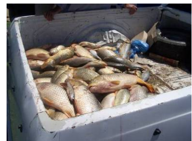
Previous carp musters have led to more than four and a half tonnes of carp being removed from the Namoi River.