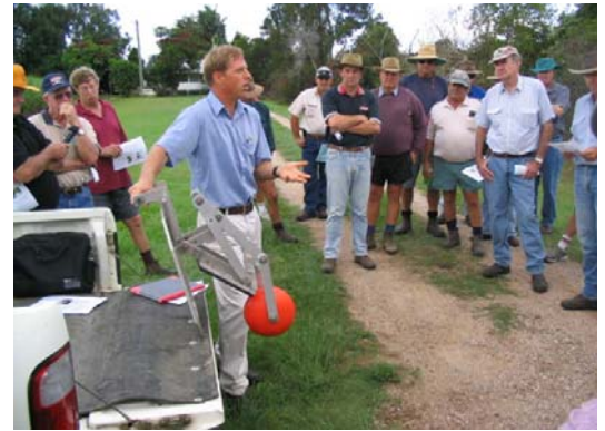
Working with communities was all part of the process of implementing on-ground works and gathering support for rehabilitation of aquatic habitat during the BBTF project.