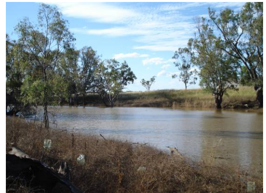
Cultural surveying workshops will be held along the Namoi demonstration reach, and may include priority sites such as Gulligal Lagoon (above).