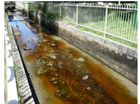
Improving the design and management of urban stormwater will lead to benefit for aquatic environments.

http://www.ecomagazine.com/view/dsp_download.cfm?article_id=EC152p14.pdf&jid=ec091216&xhtml=3d20f97b-d844-441b-b57a-13b26a8c0cdd&issue_id=152&issue_year=2010&direct=1