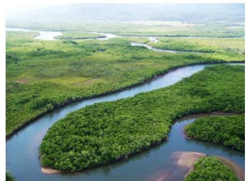
Trinity Inlet: declared Fish Habitat Area, north Queensland.

In 2009, the FHA Network celebrated its 40th anniversary, with the first areas declared in Moreton Bay near Brisbane in 1969. The network of 70 declared FHAs now protects 880,000 ha of high quality fish habitats. Declared FHAs help sustain commercial and recreational fishing sectors by protecting the habitats that sustain fish stocks while still allowing legal fishing. For more information or to get a copy of the strategy visit http://www.dpi.qld.gov.au/28_16051.htm or contact DEEDI on 13 25 23.