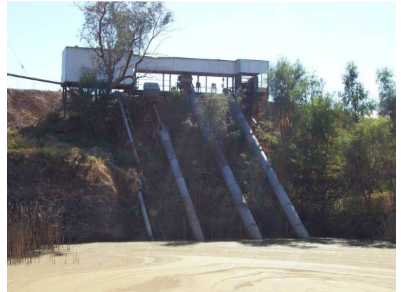
Research is underway to quantify the impact on fish of pumping from rivers into irrigation storage dams.

http://www3.interscience.wiley.com/journal/122649780/abstract