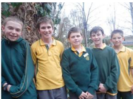
The 'De-reek the Creek' boys

www.envirostories.com.au/stories/story-books/2013books-2/