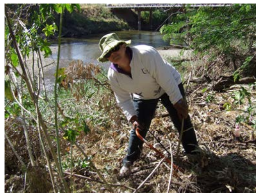
The group have treated 8.7 hectares of weeds to prepare riparian areas for replanting.

https://www.facebook.com/dubbomacquarieriver.bushcare