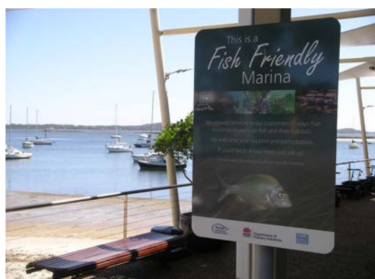
An accredited Fish Friendly marina spreading the fish habitat message to its clients and visitors.

www.dpi.nsw.gov.au/fisheries/habitat/rehabilitating/fish-friendly-marinas