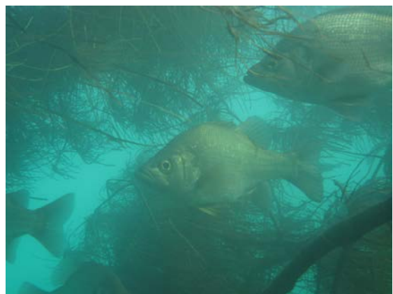
Estuary Perch in ideal habitat.