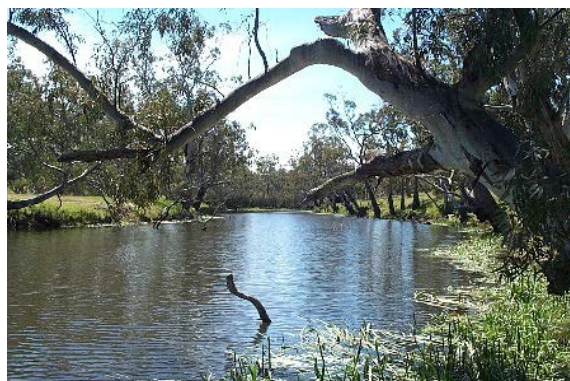
The Glenelg River – a focus for restoration work that is bringing about dividends for fish and local communities.

http://www.ghcma.vic.gov.au/media/uploads/FINAL%208431%20Glenelg%20River_R_1706.pdf