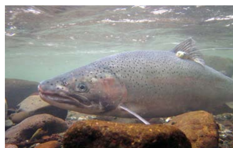
Steelhead in the Elwha River taking advantage of access to habitat.

http://e360.yale.edu/feature/the_ambitious_restoration_of_an_undammed_western_river/2701/