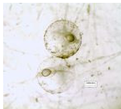
Golden Perch eggs – the result of the first detected spawning in the mid-Murray River since 2005.

http://www.depi.vic.gov.au/about-us/media-centre/media-releases/golden-perch-spawning-ends-8-year-dry-spell