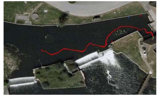
An avoidance path taken by an Eel moving downstream approaching the hydropower intake.

The European eel has suffered a dramatic decline over recent decades and the number of juvenile fish returning to rivers down by over 90 per cent. One of the key factors contributing to this decline is river infrastructure, such as hydropower stations. Because of their long bodies, eels that enter turbine intakes are likely to be struck by the rotating blades, causing physical injury and high rates of mortality. Researchers have found that the higher the water velocity entering the intake, the more likely the eels are to avoid the structure. Under normal water velocity, when the eels encountered the constricted flows of the intake, 'search' behaviour was common prior to coming into physical contact with structures. However, under high water velocity gradients, the eels swam in the opposite direction to escape rapidly back upstream. More on this research by Piper and others in the Proceedings of the Royal Society B : http://www.sciencedaily.com/releases/2015/07/150702073933.htm