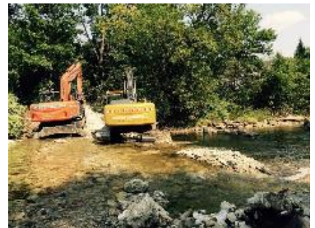
The dam, built in 1909 and unused since 1927, is no longer a barrier for Brook Trout.

http://news10.com/ap/removal-of-groton-dam-opens-wells-river-to-fish-and-flood/