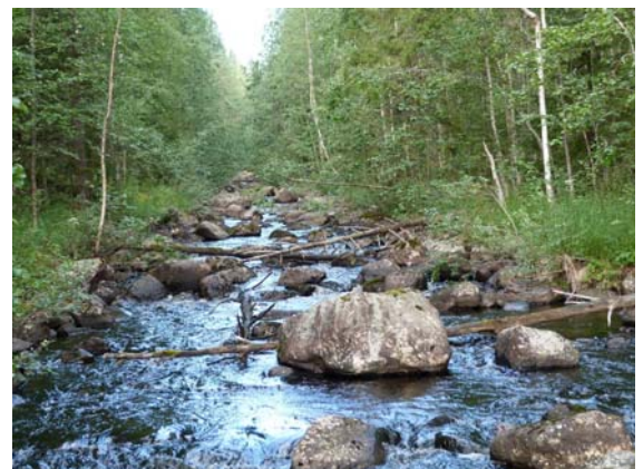
A restored stream, such as this one, can take more than 25 years to recover from the channelisation process.

Researchers in Sweden have studied the recovery of riparian areas of streams that were channelized for timber floating and have found that it takes about 25 years for an area to return to a natural state. In one area, both the main channel and most tributary streams were channelized from the 1850s to the 1950s and boulders in the streams were blasted or pushed to the sides of the stream creating levees that disconnected the stream from the riparian zone. Restoration efforts started in the 1980s, mainly to benefit fish productivity. The slow rate of recovery of the riparian areas is also thought to reflect the current practice of relying on natural re-seeding rather than seeding and planting native plants. For more of this research by Hasselquist and others in Ecological Applications : http://www.sciencedaily.com/releases/2015/06/150630100659.htm