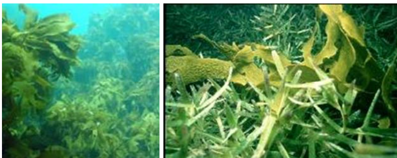
Kelp forests are the 'biological engine' of the GSR, producing as much as 65 tonnes of biomass per hectare per year.

The 'Great Southern Reef' (GSR) is the name being given by scientists to the 71 000km 2 temperate reef system, straddling five states across the southern coastline, from Brisbane to Perth. Kelp forests form a major part of the GSR, found off over 8 000km of Australia's temperate coastline, yet are largely unknown to most people. A review of the ecological, social and economic importance of these areas estimates that in regional coastal communities alone, tourism expenditure from the GSR, including reef-related tourism such as fishing, scuba diving, surfing and whale watching, was estimated at around $9.8 billion per year. The GSR is relatively healthy compared to reefs elsewhere in the world, however it is under growing pressures from climate change, population growth and urban development. Many areas of the reef are already showing severe signs of stress and degradation. Read a summary http://theconversation.com/australias-other-reef-is-worth-more-than-10-billion-a-year-but-have-you-heard-of-it-45600 or more of the review by Bennett and others in Marine and Freshwater Research : http://dx.doi.org/10.1071/MF15232 [Open access]