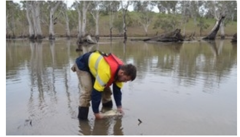
Estuary Perch are now able to travel the 300km journey from the estuary to Clunies Hole.

An Estuary Perch has travelled 300km upstream of the estuary in the Glenelg River, Victoria. This is the third time monitoring surveys have found big Estuary Perch in the area around Harrow, an area from which they had disappeared after the construction of nearby Rocklands Reservoir in the 1950s. The fish appear to be taking advantage of the removal of barriers to fish passage, an increase in environmental flows and work by local landholders to improve river health. Other native fish caught during the survey include three species of Pygmy Perch, Blackfish and Tupong. For more information: http://www.ghcma.vic.gov.au/news/article/glenelg-river-marathon-for-estuary-perch