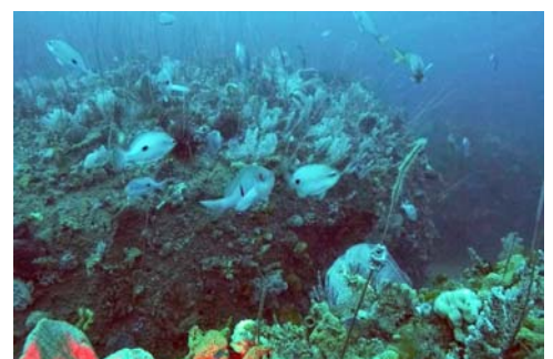
The newly identified deep reef habitats are comparable to Australia's better-known tropical reef areas.

http://www.abc.net.au/news/2015-08-22/deepsea-robot-discovery-rivals-great-barrier-reef-parks-victoria/6717028