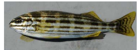
The growth of Western Striped Grunter in the estuary was seasonal but peaked earlier and was greater than in marine waters.

Researchers in Western Australia have used individually-aged fish to track how the Western Striped Grunter's use of different habitats varies with time of the year and life stage. They found that growth peaks in the summer, a time of better food supply and warmer waters, and that the migration behaviour between coastal and estuarine habitats changes with age. The species spawns from October to February and spends the first year of life in near-shore or estuarine seagrass meadows before it migrates into deeper coastal waters with sparser seagrass to mature. The fish move back into the estuary soon after maturing in mid-summer. The fish from the estuary were all less than 4 years old, whereas those caught in coastal habitats were up to 10 years old. This highlights the importance of the estuary as a nursery for this species. More information in summary: http://sciencewa.net.au/topics/fisheries-a-water/item/3636-grunter-s-life-choices-chronicled-in-fisheries-study#k2Container More on the research by Veale and others in Marine and Freshwater Research : http://dx.doi.org/10.1071/MF14079