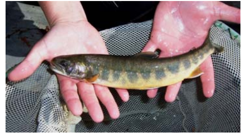
The Arctic Char: a relic species helped by the use of rotenone.

As the last glaciers retreated from North America, Arctic Char adapted to a freshwater life cycle. This species was once not rare but now survives in only a dozen ponds in northern Maine. Facing extinction in one of the most important refuges, known as 'Big Reed', the decision was made to use the fish poison rotenone to eliminate invasive fish species and give the Arctic char a chance to recolonise. In the three years preceding treatment only about a dozen of these fish were captured but they formed the basis of a conservation breeding program. The resulting fry, along with that of Big Reed's native Brook Trout, were restocked in Spring following the treatment. The Brook Trout population, which had also declined significantly, has exploded. The Arctic Char are now mature and thriving, but it appears their much longer life cycle means that they have not yet spawned. This is not the only example of the use of rotenone in fisheries management and it is not without controversy. For more on this and other stories about the use of rotenone: http://blog.nature.org/science/2015/08/19/recovery-the-return-of-native-fish-victims-of-bucket-biology/