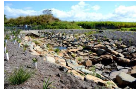
Large boulders were carefully laid in the rehabilitated Lagoons Creek to create tiered levels which slow water flow and will help fish migrate through the Creek.

http://www.abc.net.au/news/2015-08-03/lagoons-creek-rehabilitation-gives-fish-new-hope-in-mackay/6668374#.VePkr-psQz8